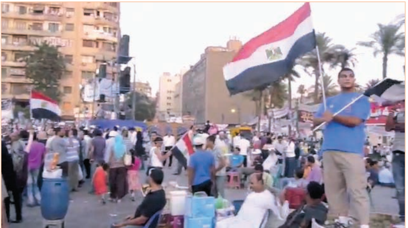
Tahrir Square, Cairo, July 15, 2011