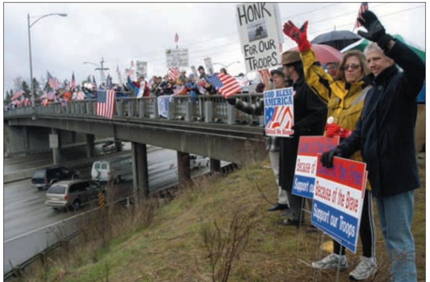
Tacoma, Washington (March 8, 2003). Members of "Operation Support Our Troops" brave wet weather during a rally outside the main entrance to McChord Air Force Base. Local organizers gathered to show support for the President and the men and women of the U.S. military at home and abroad.

From the perspective of the American people, the principal attribute of this relationship is that it entails no real obligations or responsibilities. Face it: It costs us nothing yet enables us to feel good about ourselves. In an unmerited act of self-forgiveness, we thereby expunge the sin of the Vietnam