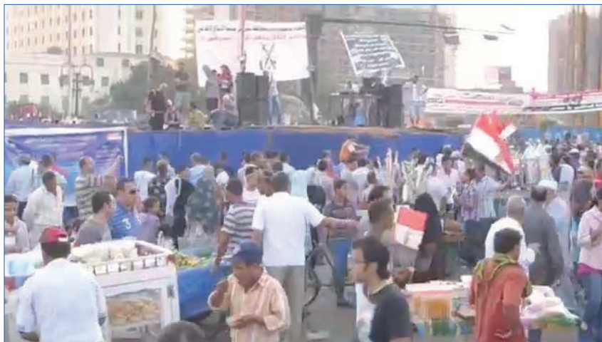
Tahrir Square, Cairo. July 15, 2011.

Instead of obsessing about the Muslim Brotherhood and Hamas and Hezbollah, what if we unilaterally, openly and enthusiastically focus instead on what Israel offers?