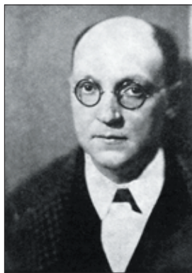
Georges Duhamel: “I hate the twentieth century as I hate rotten Europe and the whole world...”

In 1919 the Allies, having won a Pyrrhic victory, forced Germany to sign a punitive treaty declaring itself solely to blame for the war, thus virtually assuring another war. For antiwar people, Hochschild concludes, their struggle against mass industrialized violence “remains to be fought again — and again.” ☆