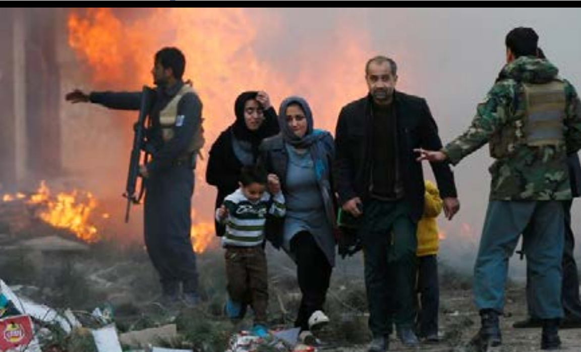
Survivors of an attack in Kabul move away from the ensuing blaze.

Official U.S. estimates of the Taliban’s threat and influence “seem more spin than objective.”