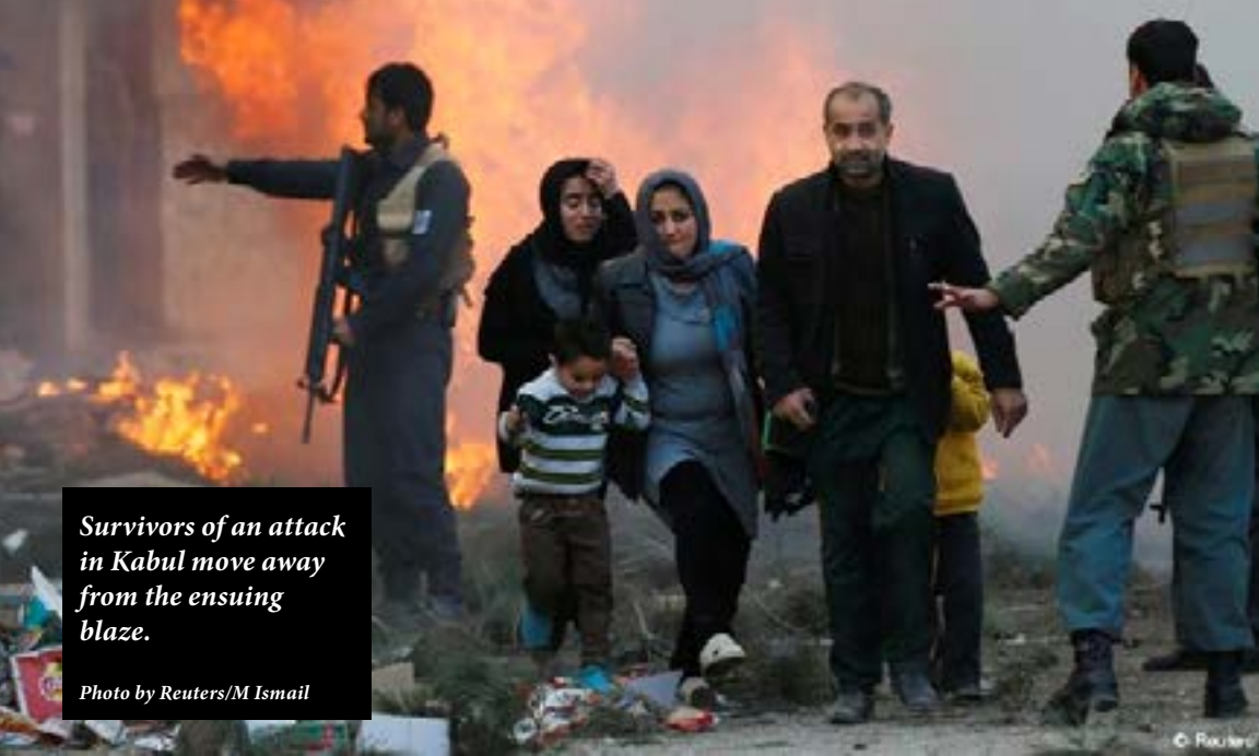
Survivors of an attack in Kabul move away from the ensuing blaze.