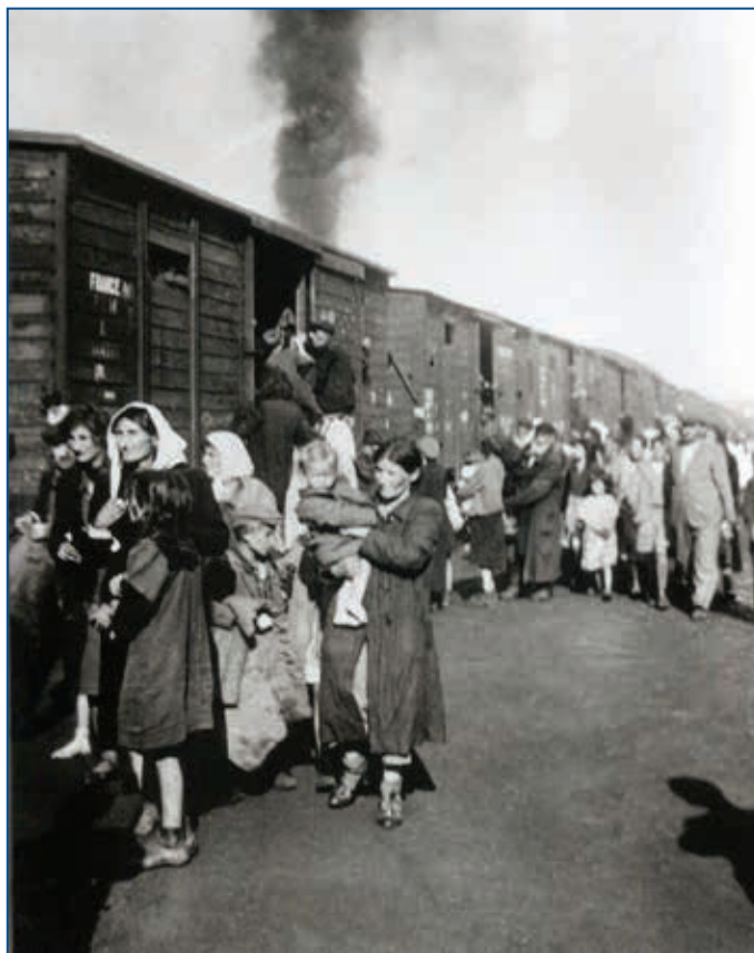
1942: Deportation of Polish Jews to Treblinka extermination camp from the ghetto in Siedlce, occupied Poland.