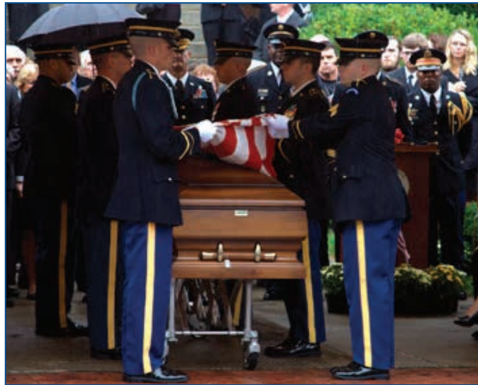
A military honor guard lays a fallen soldier to rest.

Some years after Vietnam, in a documentary on the war, an older couple was filmed sitting quietly in their living room, a picture of a young man in uniform in a silver frame