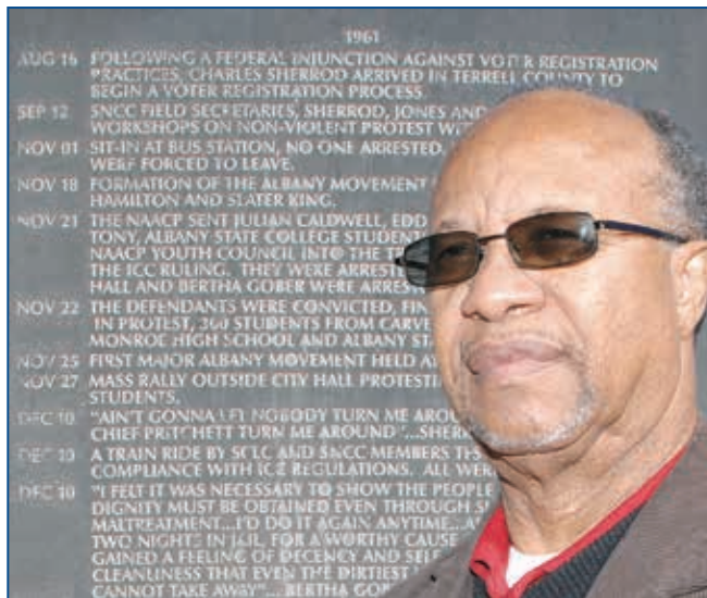
The Reverend Charles M. Sherrod, pictured next to one of four monuments at the Civil Rights Park in Albany, Georgia.

Up Nawth the black mind-set wasn’t all that different but with an entirely different circumstance. When I held a seminar on Black Nationalism at Monteith College for half a